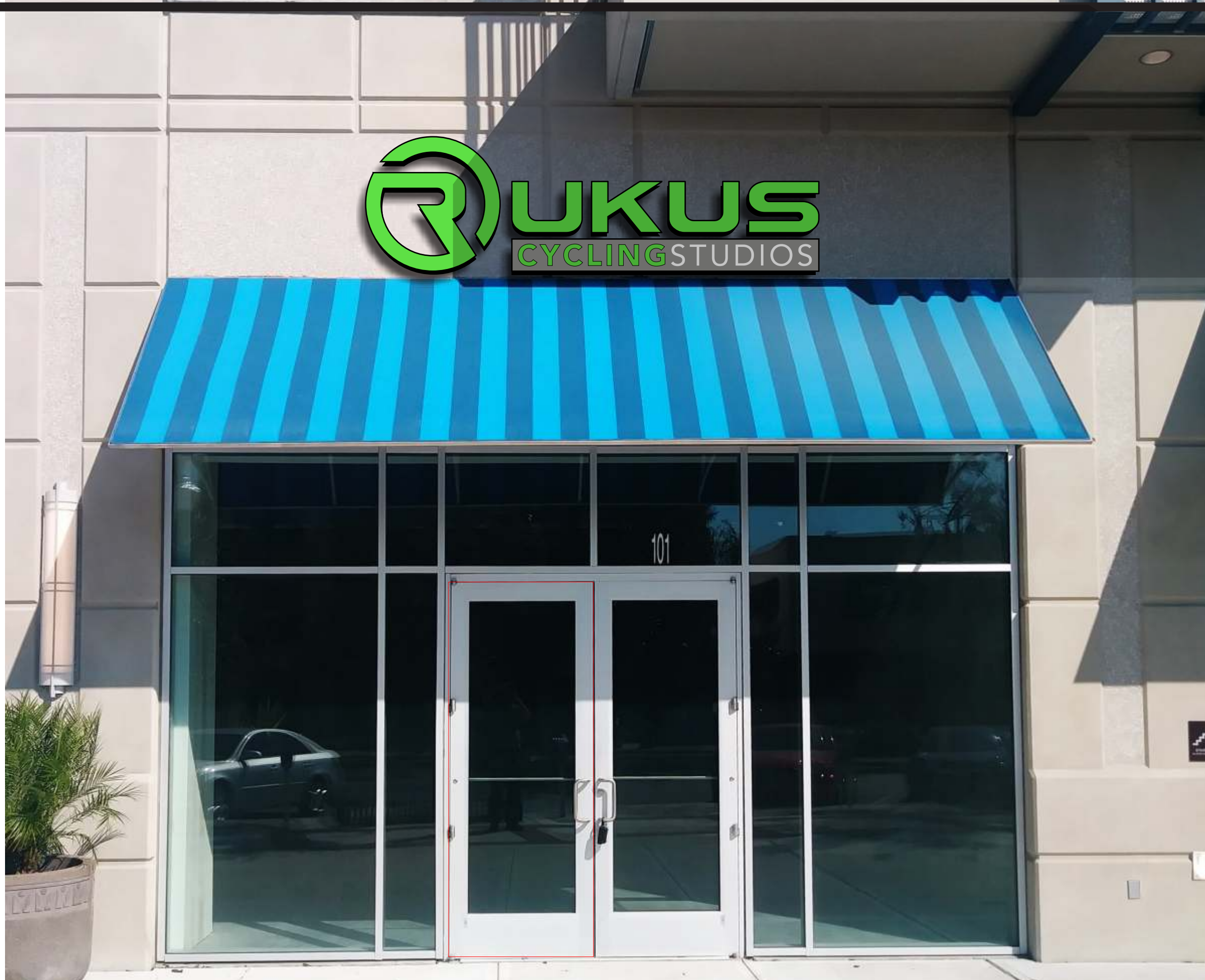
CHANNEL LETTERS - LEFT ENTRY DOOR

MEDIA1 identity solutions WRAPTHIS advertising on the go